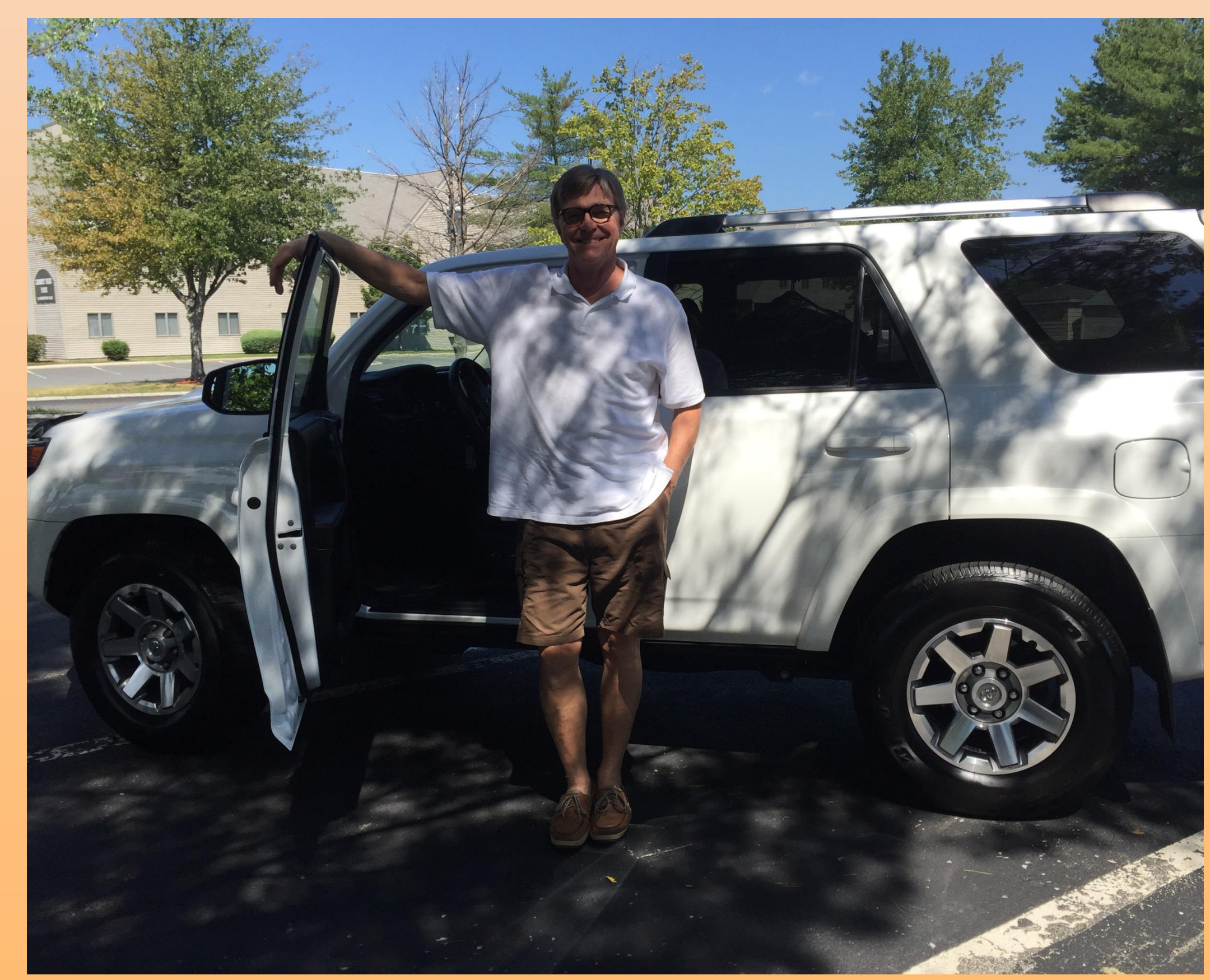
A volunteer driver in western Massachusetts stands with his vehicle before picking up a rider for transportation to a social outing.