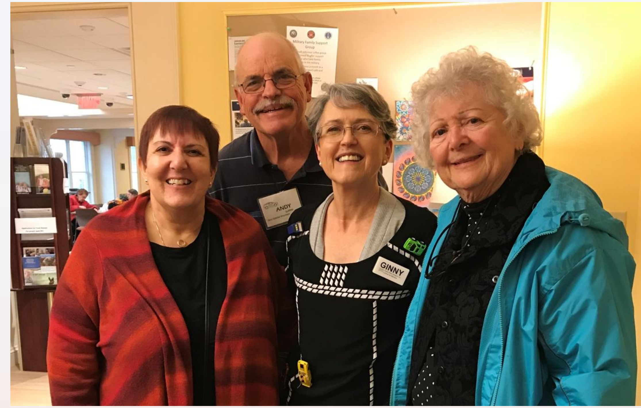
The Director of Northern Essex Elder Transport (center), a regional volunteer driver program that serves 14 communities in northeastern Massachusetts, stands with a few of her volunteer drivers.

Monthly newsletter: www.mass.gov/massmobility-newsletter